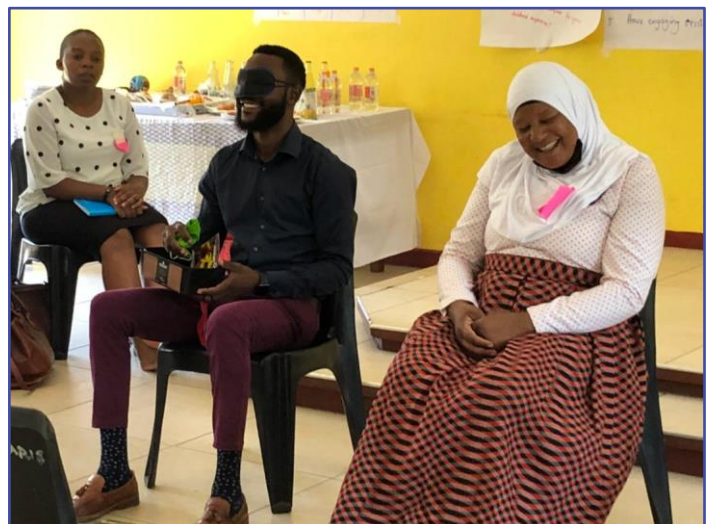
Secret in a Box