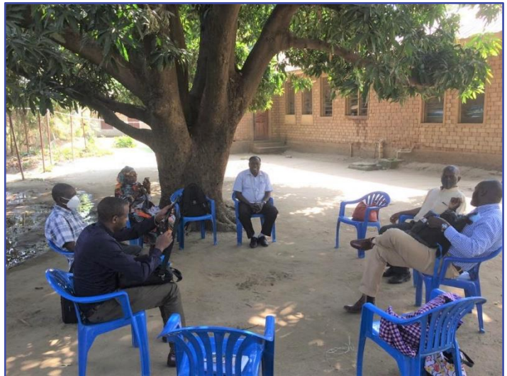
Facilitating under a tree

“The suffering is quite high and they may feel that with the little they have they cannot take Mind-Heart Dialogue forwards, so we made it look like it’s possible to do anywhere, at any time with any group. They were excited to be under the mango tree and we used it to illustrate the transformation tree which became clearer as we were using a real tree.” Facilitator