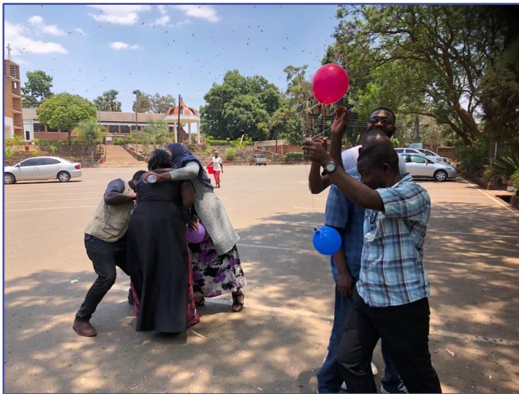
Child Protectors' Balloon game

As vaccination hesitancy persists in Malawi and it is an area of ongoing partnership between UNICEF and the Public Affairs Committee (PAC, the Malawi IRC), the organizers selected this as an area of focus for days two and three, enabling participants to really analyze the drivers of vaccine hesitancy through drama, prioritize the top ones through bean ranking and identify the desired behavior changes. The participatory drama also enabled participants to empathize with characters holding very different views to their own as the audience were asked to take on the roles of different characters and say what they were feeling,