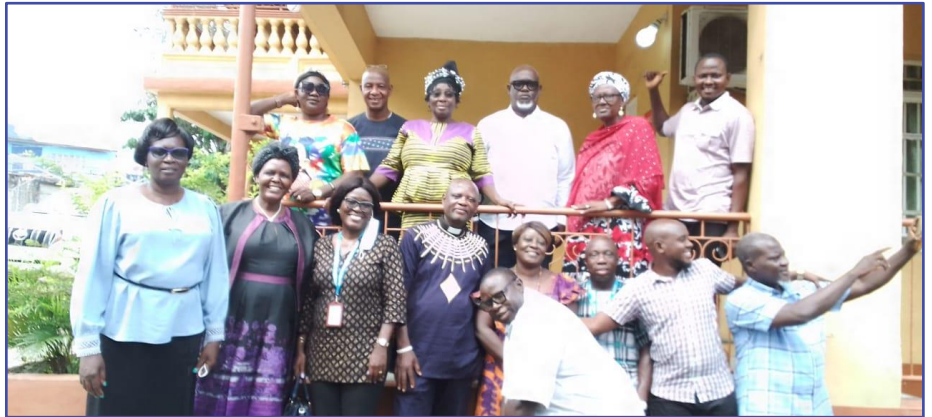
Posing with UNICEF after technical session

a great role in the outcomes we see in their lives today... this will always be in my mind and wherever I go, I'll make sure I try to bring it wherever I go, so people can engage in dialogue, whether parents or guardians or politicians.”